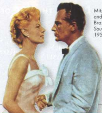
Mitzi Gaynor and Rossano Brazzi in the film South Pacific , 1958.