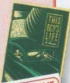
This Boy's Life , by Tobias Wolff; Long Time Leaving: Dispatches from Up South , by Roy Blount Jr.