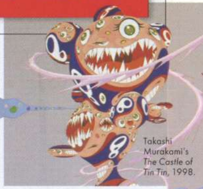
Takashi Murakami's The Castle of Tin Tin , 1998.

5 ▶ Don't miss your last chance to view the Takashi Murakami retrospective, " ©Murakami, " in the United States before it travels abroad. Beginning April 5 at the Brooklyn Museum, the exhibition presents more than 90 paintings, sculptures, installations, and anime by the Japanese artist. (brooklynmuseum.org)